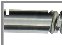
Hss pilot drill for Clic II hole saw 120 mm